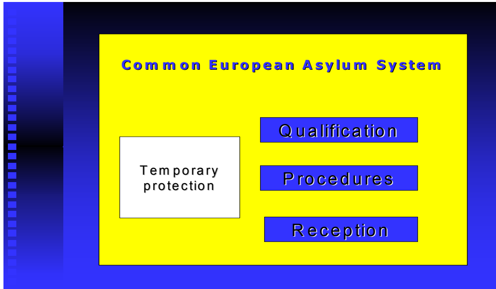
Figure 1: The current Institutional organization of issues within Justice and Home Affairs.

This is essentially the administrative and legal agenda of the EU, with no regard for the broader philosophical discussions of the last five years.